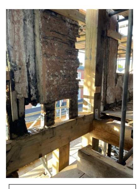
New structural oak beams on the upper floor