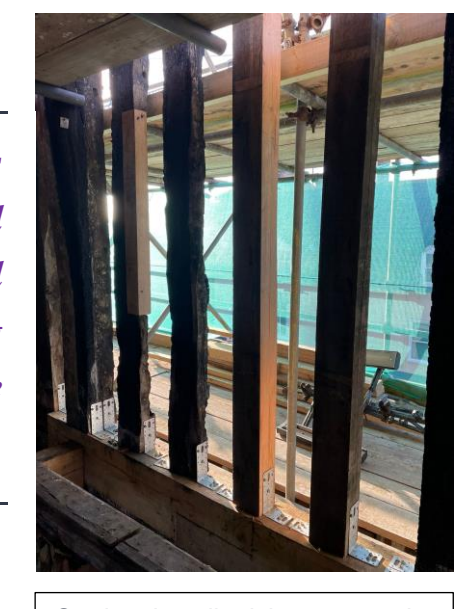
Studwork wall mixing new and still structurally sound charred timbers

The roof structure is already going up and by Christmas may well be covered enabling the removal of the protective scaffolding.