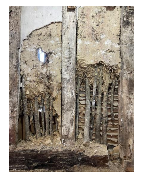
Wattle and daub panels showing natural wood

After several weeks of painstaking work to reveal the detail of old and often rotting timber and structure the reconstruction of the oldest part of the building is now well underway. The contractor's brief, required by the terms of the Heritage Funding, is for the retention of as much as possible of the original structure. The George was not in a good state of repair when the fire happened in 2013 and the intervening ten years of weathering has led to multiple discoveries of timber and coverings that are too deteriorated to save. Despite that, much remains and the contractor, Seamans, have been inserting new timber where necessary to create a viable structure. The panels between the structural framework were originally 'wattle and daub' using wood that retained its natural shape and curves and some of these survived the fire and subsequent weathering.